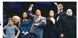
The Addams Family